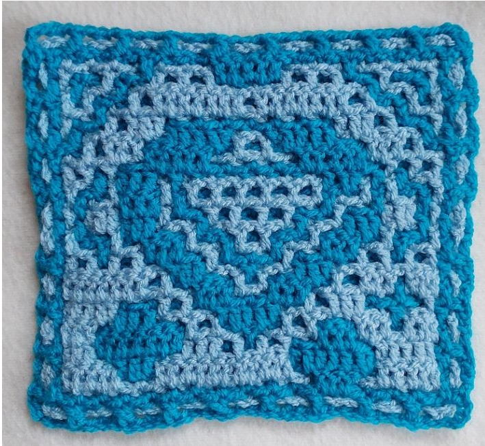
The block at the front side without the border