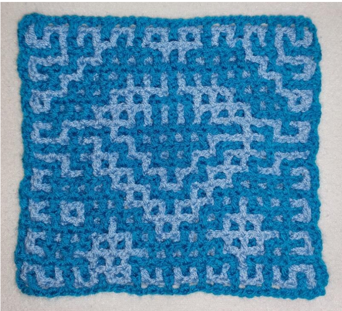
The block at the back side without the border