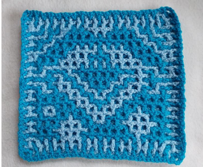
The block at the back side with the border